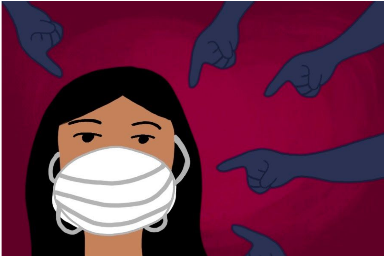
Illustration by Catherine Buchaniec