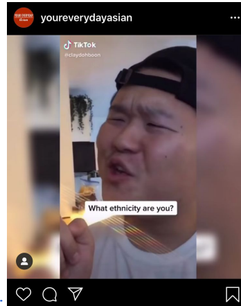
Group 6 (video):