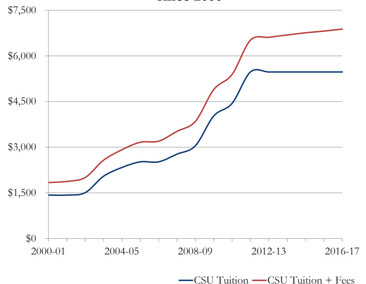
Increases in CSU Tuition and Mandatory Fees since 2000

Fact: Campuses collected more than $100 million in "student success fees" during the 2015-16 academic year.