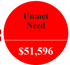
Real cost of attendance and unmet need for a typical CSU Student