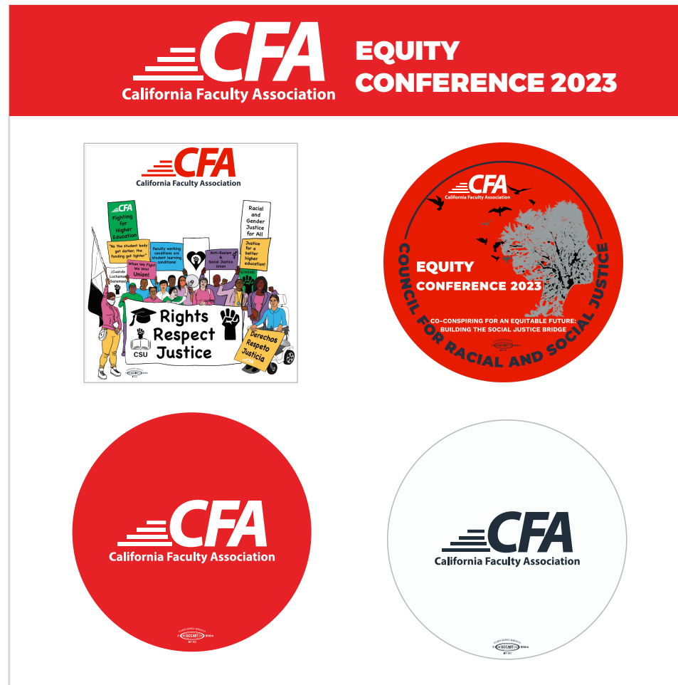
5" SQUARE STICKER SHEET STICKERS APPROX. 1.75" WIDE EACH

By submitting approval, you are giving permission for us to complete your order with the quantity, layout size, position, spacing, spelling, item number, item color, and imprint color indicated on the supplied proof.