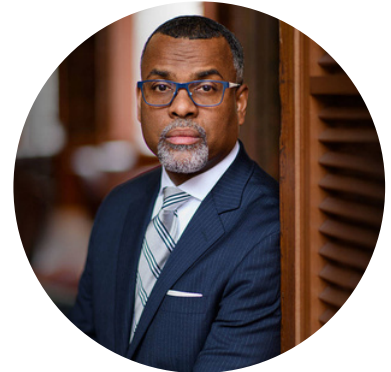
DR. EDDIE GLAUDE, JR.