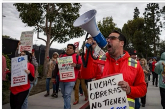
Faculty chanted in support of issues ranging from Palestine, immigration safety and free speech from the upper quad area to Rotman Hall at the April 17 rally.